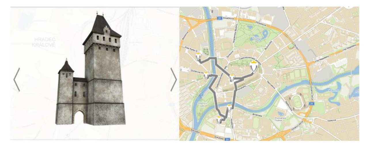
Fig 2. Display transformed 3D model

For a video, the video will play in full screen. It will be possible to carry a combination of this data, then it will be displayed in text with a link to the video, which will be clicked again by a full screen overlay. Therefore, the video will be a custom module that will be triggered by the user click through. The last type of data displayed to the user will be transformed 3D models. For the transformed 3D model, a custom module within the application will be created again, allowing the user to freely view the model by rotating and zooming over its own object. On the interactive map, the user will also be able to view through the "street view". This view will be enabled mainly if it is a "virtual tour" and the user will not be physically present at the location, in order not to deny the possibility of comparison.