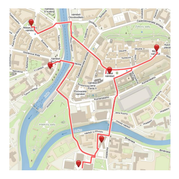
Fig 1. Preview of map with route

After starting the application, the user will be offered a menu of processed locations and switch to the map where he or she is currently located. When you select a location, the map of the selected location is loaded. The interactive map will contain points indicating the processed locations. Clicking on that point will have different responses depending on the type of information it contains. When you save text and image information about a location, an info balloon with the description and image gallery will be displayed.